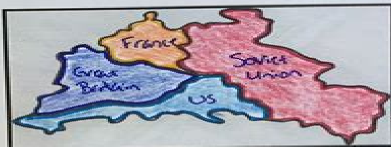
Berlin divided into 4 occupational zones

Label each flag below and then draw lines to the areas or the areas in Germany and Berlin that were occupied by the country.