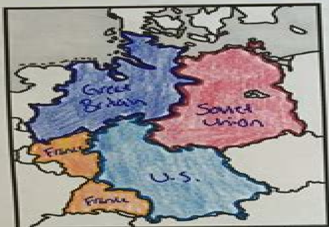
Germany divided into 4 occupational zones

After World War II, Germany and the city of Berlin were divided into occupational zones by the United States , Great Britain , France , and Soviet Union .