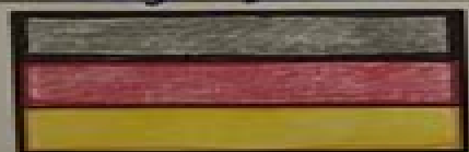
Federal Republic of Germany

In May 1949, the Soviets ended the blockade. In the fall of 1949, the Federal Republic of Germany ( West Germany ) was created with its capital at Bonn and the Soviet Union created German Democratic Republic ( East Germany ) with its capital at East Berlin .