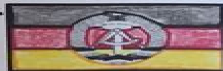
German Democratic Republic