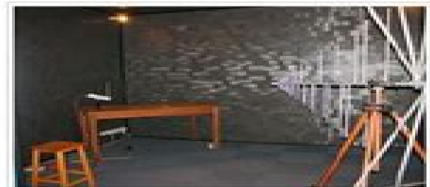
Anechoic RF chamber used for EMC testing (radiated emissions and immunity). The furniture has to be made of wood or plastic, not metal.

Interference mitigation and hence electromagnetic compatibility may be achieved by addressing any or all of these issues, i.e., quieting the sources of interference, inhibiting coupling paths and/or hardening the potential victims. In practice, many of the engineering techniques used, such as grounding and shielding, apply to all three issues.