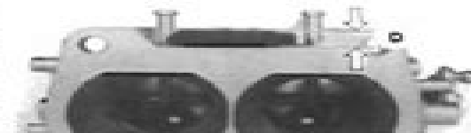
Fig. SZ18-2—Float height (D) should be 9.5-11.5 mm (0.37-0.45 in.). Bend tang on float arm to adjust.