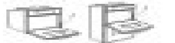
Diagram illustrating the internal components of a single electric baking oven.

Electric baking ovens are available in single and double oven configurations. Single ovens are typically found in smaller kitchens, while double ovens are found in larger kitchens or commercial settings. Both types offer a wide range of features and options to suit your needs.