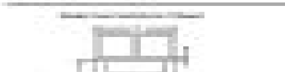
Diagram illustrating the steps for using a single electric baking oven.

Before installing your electric baking oven, ensure that the electrical outlet is properly grounded and rated for the oven's power requirements. Consult the manufacturer's instructions for specific details.