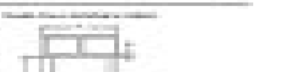
Diagram illustrating the steps for using a double electric baking oven.

Before installing your double electric baking oven, ensure that the electrical outlet is properly grounded and rated for the oven's power requirements. Consult the manufacturer's instructions for specific details.