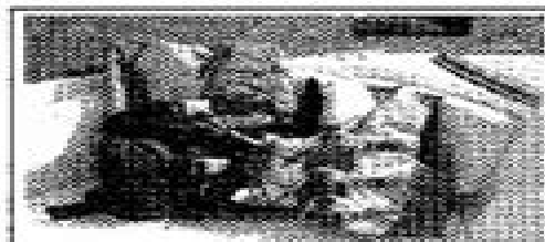
Fig. 7 Type II PFDs are recommended for inshore-inland use on calm water (where there is a good chance of fast rescue).