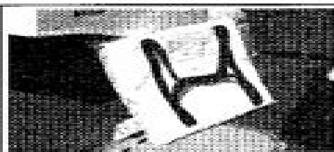
Fig. 8 Type IV buoyant cushions are thrown to people in the water. If you can squeeze air out of the cushion, it should be replaced.