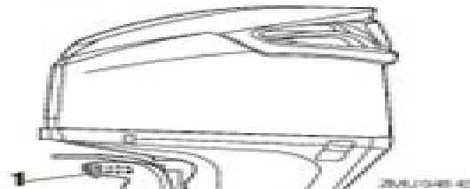
1. Manufactured date label location

This label is attached to the clamp bracket or the swivel bracket.