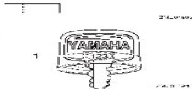
1. Key number

If a main key switch is equipped with the motor, the key identification number is stamped on your key as shown in the illustration. Record this number in the space provided for reference in case you need a new key.