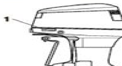
1. Approval label location

This label is attached to the bottom cowling. Existing Technology; N/A.