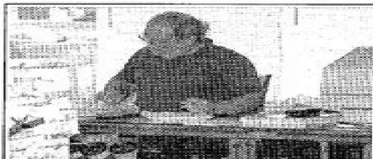
Fig. 2 By far the most important asset in purchasing parts is a knowledgeable and enthusiastic parts person