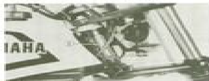
1. Frame serial number

The frame serial number is stamped into the right-side of the steering head pipe.