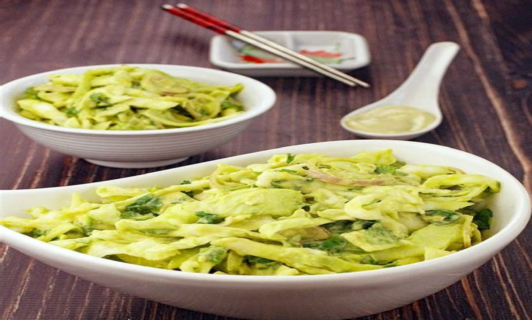
Wasabi Cole Slaw