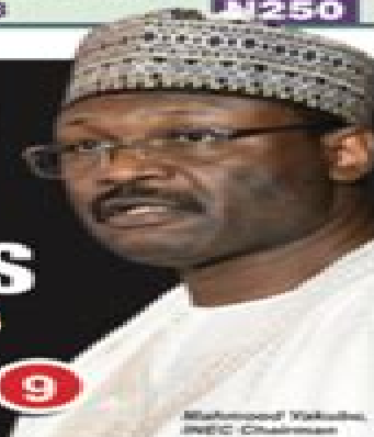
Mahmood Yakubu, INEC Chairman