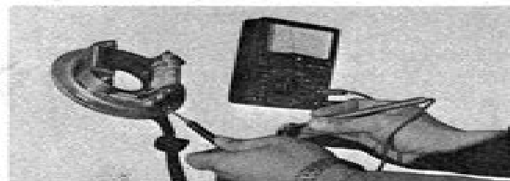
Fig. 8-5-2 Measure the resistance of pulser coil