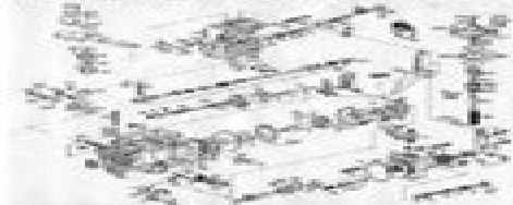
Bosch diesel fuel injection pump repair manual, 2009 yamaha grizzly 700 owners manual

Le logiciel devrait alors identifier et inscrire de lui-même la CPU connectée. Si la CPU n'est pas identifiée ou s'il apparaît un message signalant que la communication n'est pas possible, double-cliquez sur le champ Câble PPI.