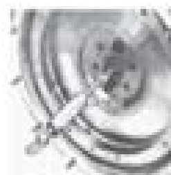
Fig. 52: Removing the flywheel bearing