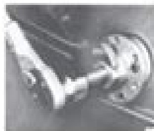
Fig. 49: Removing the timing belt