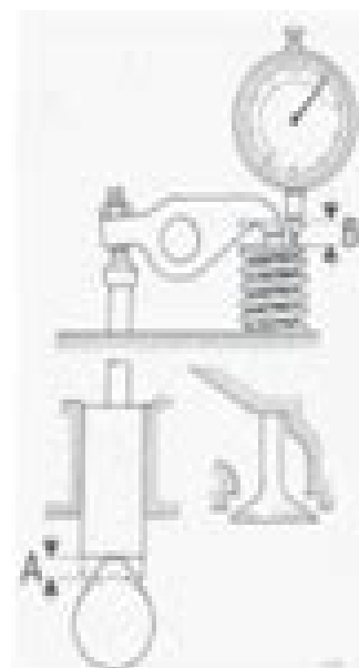
Fig. 48: Checking the crankshaft