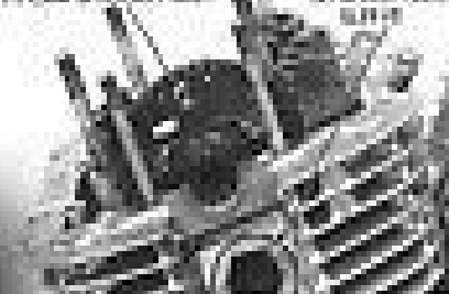
12 SPARK PLUG (180°)