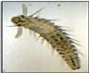
polychaete worm larvae

These organisms are the marine relative of earthworms. The larvae are found in the plankton. The adult form, seen in the invertebrate lab, is benthic.