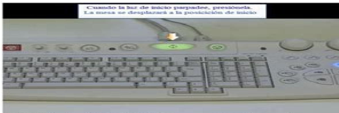
Figura 15-10). Cuando el botón de Start Scan se enciende indica que la programación ha sido correcta. El Técnico lo aprieta y comienza la adquisición. Aquilion 64 (HUMS).