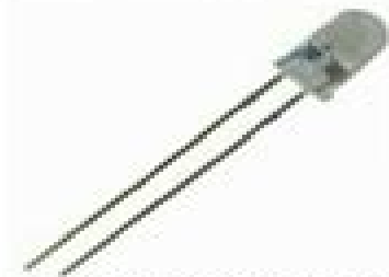
Light Emitting Diode