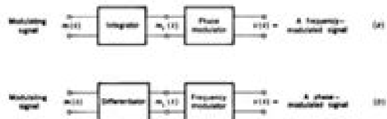
Figure 4.3-1 Illustrating the relationship between phase and frequency modulation.