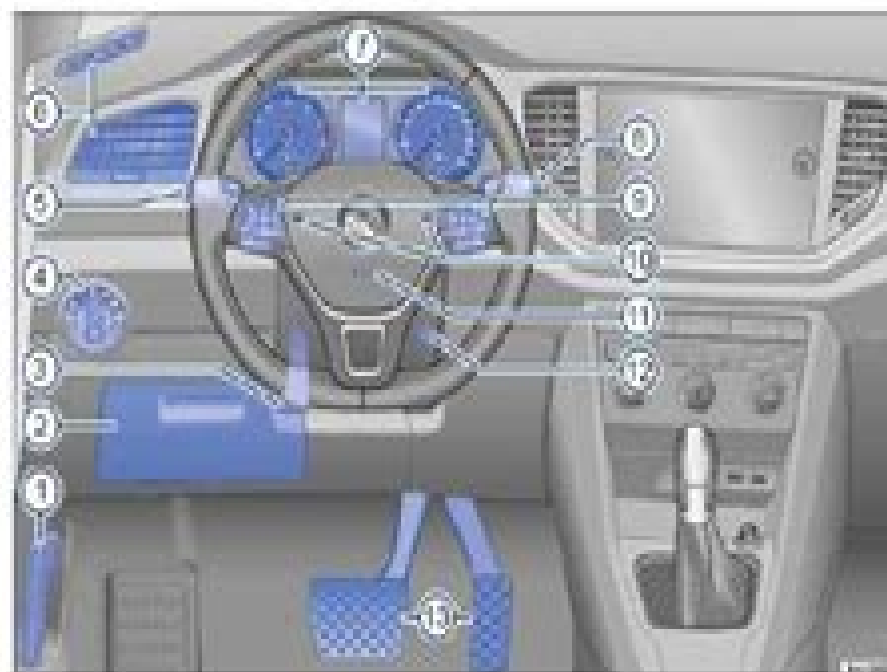
Fig. 4 Overview of the driver side (left-hand drive vehicles)