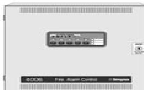
4006-9102 (Beige) Standard Control Panel