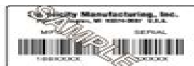
North American Models