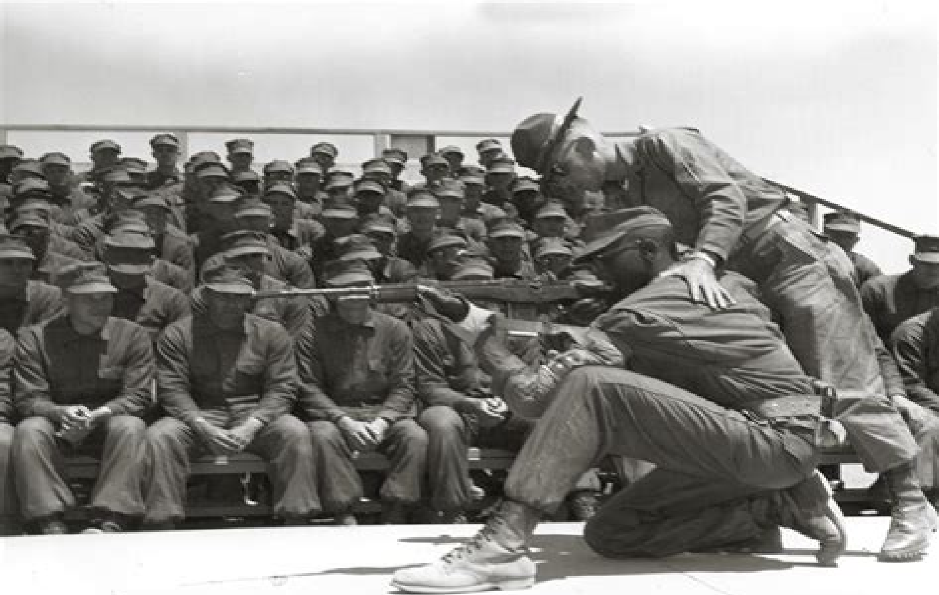
PMI DEMONSTRATING THE KNEELING SHOOTING TECHNIQUE. WTBN, EDSON RANGE 1965.