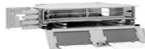
Rack Mount Termination/Splice Panel (Empty)