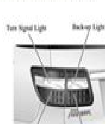
Stop Light and Taillight