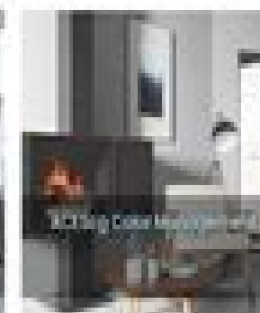
Working Color Management