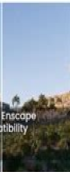
V-Ray & Enscape compatibility