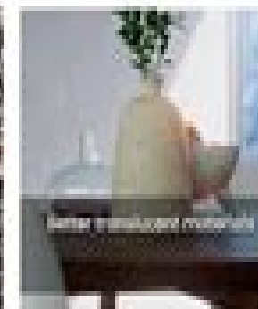
Same translucent materials