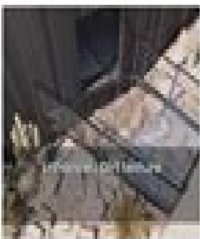
Advanced dirt texture