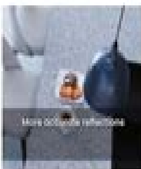
More colorful reflections