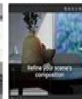
Refine your scene's composition