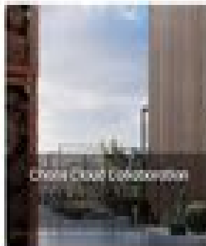
Cloud Cloud Colorization