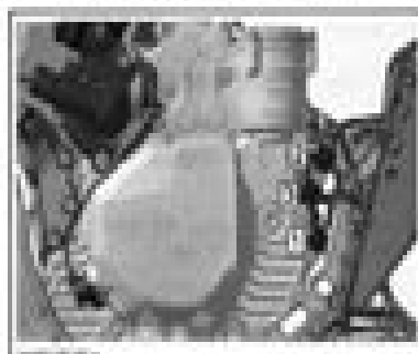
Front Engine Support