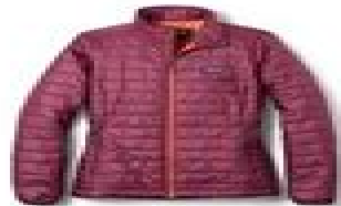
MID WEIGHT LAYER