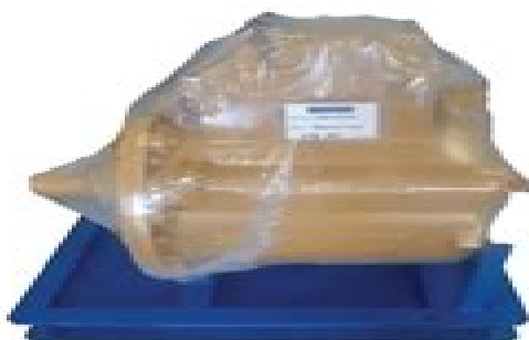
D11R/T TRANSMISSION RECON OUTRIGHT: $80,000+gst ea.