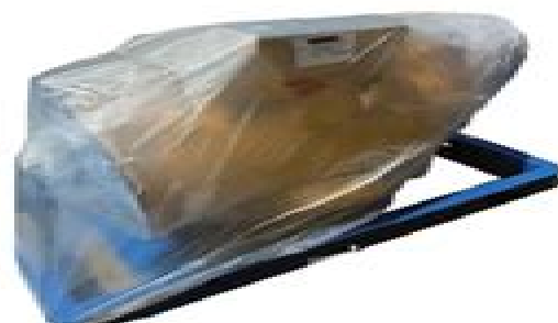
789C TRANSMISSION RECON OUTRIGHT: $120,000+gst ea.