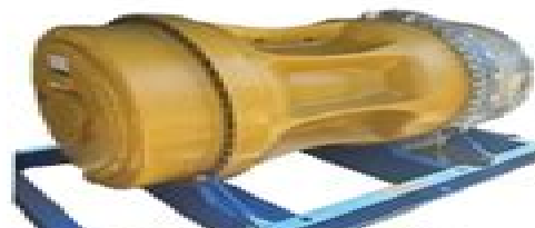
789C/D FINAL DRIVE RECON OUTRIGHT: $180,000+gst ea.