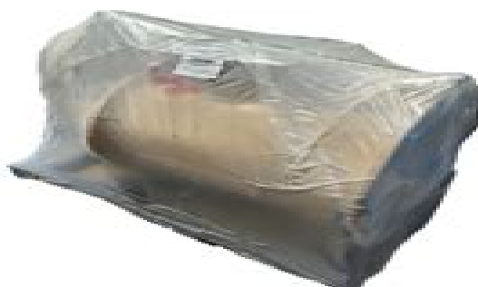
777G TRANSMISSION RECON OUTRIGHT: $130,000+gst ea.