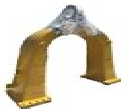
785/789C/D A FRAME RECON OUTRIGHT: $40,000+gst ea.