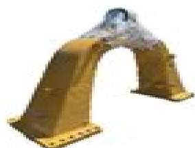
793C/D/F A FRAME RECON OUTRIGHT: $50,000+gst ea.