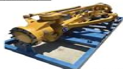
24M FRONT AXLE GROUP RECON OUTRIGHT: $140,000+gst ea.