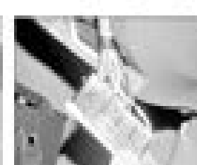
4.6f ... undo the heater retaining screws using sockets from the panel ...

6 Remove the upper cover (see paragraphs 1 and 2) then undo the retaining screws and