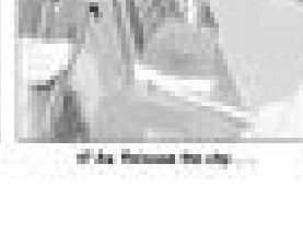
4.6d ... undo the heater retaining screws using sockets from the panel ...