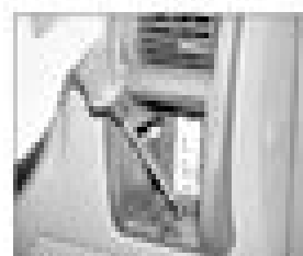
4.5b ... undo the heater retaining screws using sockets from the panel ...