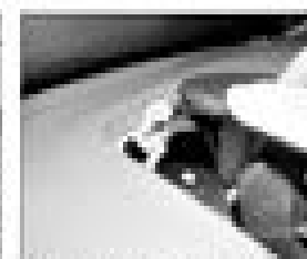
4.6e ... undo the heater retaining screws using sockets from the panel ...

draw them from the rearward panel. If necessary, undo the screws and remove the multi-function display unit from the panel (see Illustration 6) .