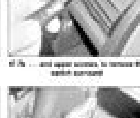
4.6c ... undo the heater retaining screws using sockets from the panel ...