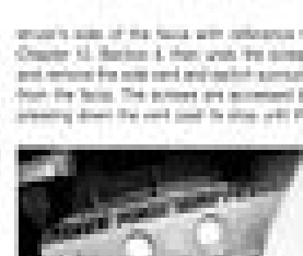
4.6a ... undo the heater retaining screws using sockets from the panel ...