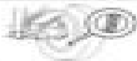
Diagram 2: Equipment