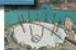
The River Lea basin