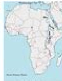
The Nile river basin

The River Lea is a long river in the east of England. It flows from the north to the south. It is important to the people who live there. The River Lea is one of the longest rivers in the east of England.