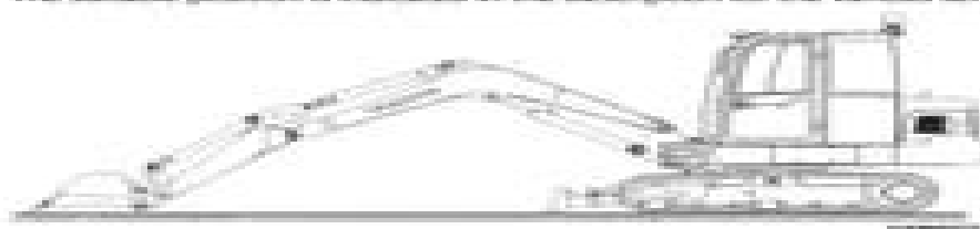
Figure 1 Service position A

The suitable position is indicated in the description for the various service jobs.