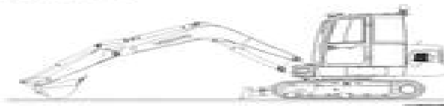
Figure 3 Service position C