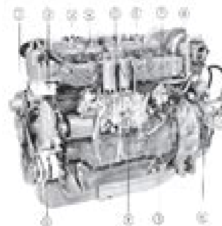
Fig. 4 Engine TAMD40, TAMD40C

The fuel system is well protected from interruptions during running by means of an electric, replaceable fuel filter. On the TAMD40 engines the fuel injection pump is large mounted under the other engine from the pump fitted on a bracket.