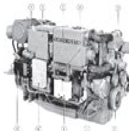
Fig. 3 Engine TAMD40

The engines are fitted with a heat exchanger for thermodynamic, controlled fresh water cooling of the engine block, cylinder heads and exhaust manifold. The exhaust manifold cooling panel is designed so that it also cools the exhaust ports.