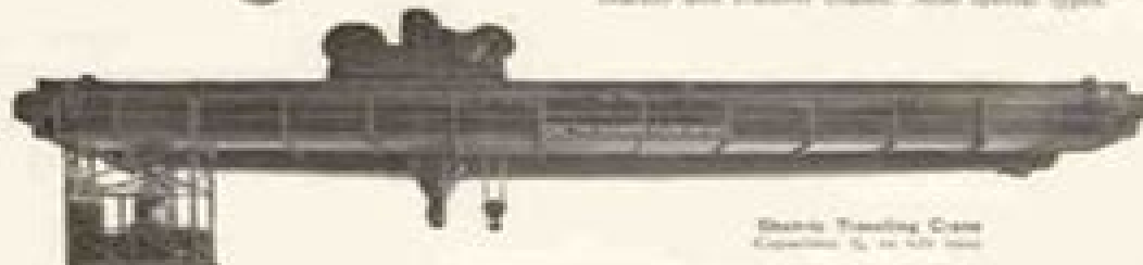
Electric Traveling Crane Capacity 1/2 to 400 tons

Overhead electric traveling cranes, 1, 2 or 3-ton capacity or floor-operated, but no initial problem, single or multiple speed control, stationary, mobile, stationary and self-propelled cranes. Overhead, single beam, double beam, gantry, jib, bracket and transfer cranes. Also special types.