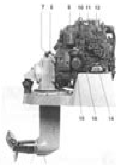
MD2010A/B & MD20