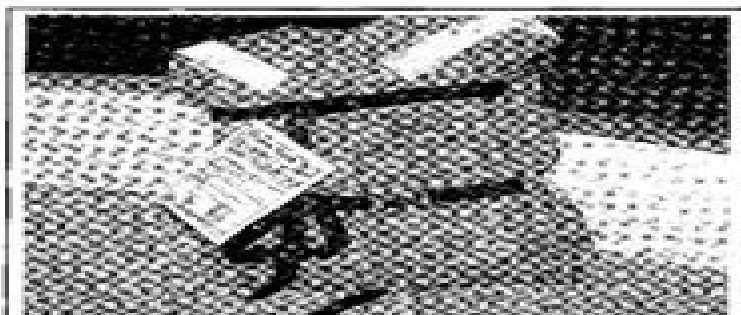
Fig. 7 Type II approved flotation devices are recommended for leisure and inland cruising on calm water. Use them where there is a good chance of fast rescue.

A Type II life jacket is also called a near-shore buoyant vest. It is an approved, wearable device. Type II life jackets will turn some unconscious people from face down to vertical or slightly backward positions. The adult size gives at least 15.5 pounds of buoyancy. The medium child size has a minimum of 11 pounds. And the small child and infant sizes give seven pounds. A Type II life jacket is more comfortable than a Type I but it does not have as much buoyancy. It is not recommended for long hours in rough water. Because of this, Type IIs are recommended for leisure and inland cruising on calm water. Use them where there is a good chance of fast rescue.