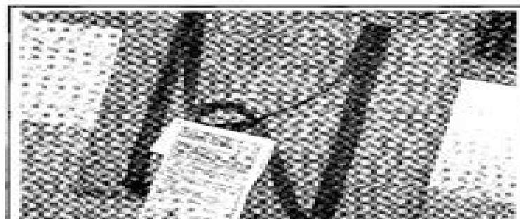
Fig. 8 Type IV buoyant cushions are made to be thrown to people in the water. If you can squeeze air out of the cushion, it is faulty and should be replaced.

Type IV ring life buoys, buoyant cushions and noninflated buoys are Coast Guard approved devices called throwables. They are made to be thrown to people in the water, and should not be worn. Type IV cushions are often used as