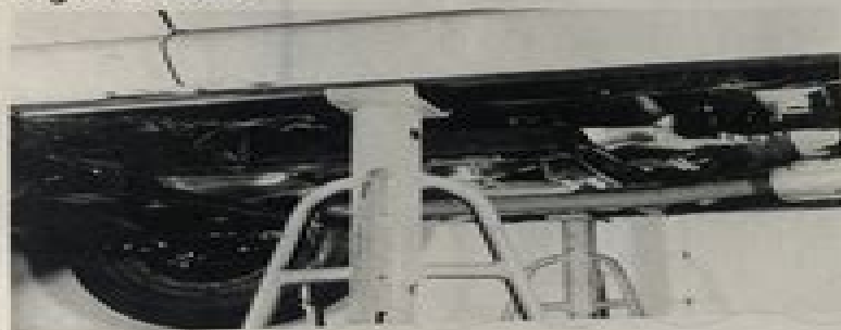
Fig. 1-3 Front