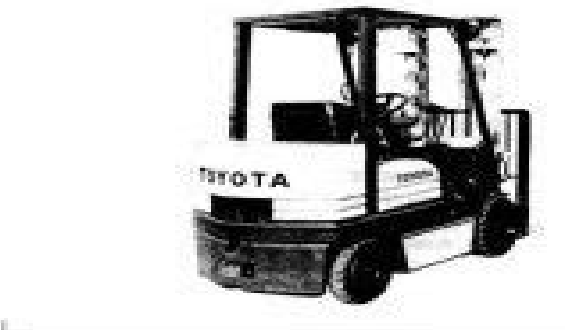
Vehicle Rear View