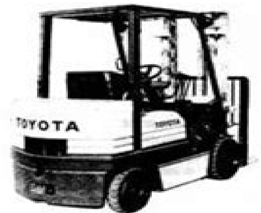
Vehicle Rear View