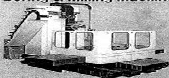
Table-Type Horizontal Boring & Milling Machine