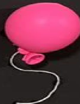
Air in the balloon