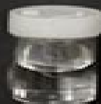
Water in the container