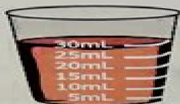
A. Medication Cup