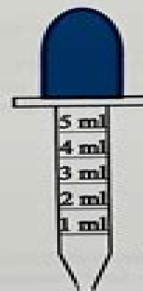
D. Oral Dropper

Answer the following questions 92 through 95 referring to the above devices.