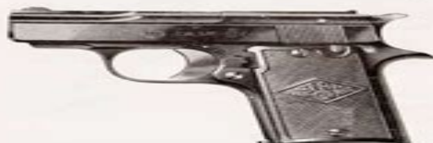
Modelo «C. O.» STAR Cal. 0,35, 6 tiros.

Cal. 7,65 y 9 mm. (380). 6 tiros con dos cargadores.