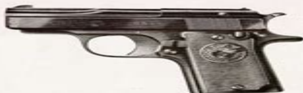
Modelo «H» STAR

Peso del arma: 200 gramos, largura 100 mm, y largura del cañón 55 mm. Ptas. 58,--