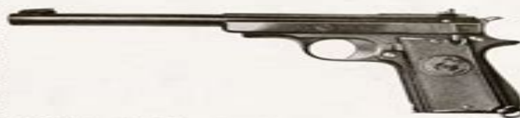
Modelo «F. T. B.» Especial para el tiro al blanco. STAR Cal. 22 de 11 tiros.

Peso del arma: 400 gramos, largura 140 mm, y largura del cañón 70 mm. Ptas. 50,--