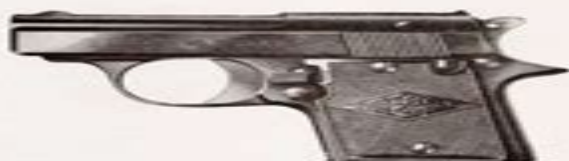
Modelo «E» STAR Cal. 0,35, 6 tiros.

Peso del arma: 200 gramos, largura 100 mm, y largura del cañón 55 mm. Ptas. 58,--