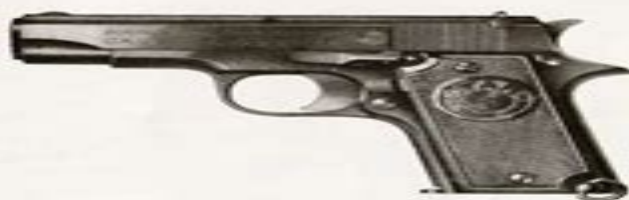
Modelo «D» STAR

Cal. 9 mm. (380), 6 tiros, cañón móvil y con dos cargadores.