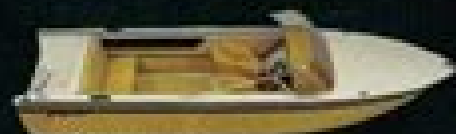
18' Nova, page 5.