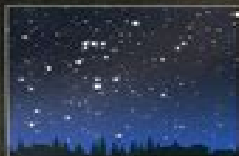
APRIL 1, 8 PM

Our view into the universe is constantly changing. As Earth makes its daily spin, the Sun leaves the sky, darkness falls, and the distant stars come into view. Also, through the course of a year, the starry sky seen from a fixed point on Earth will change. The Sun, Moon, and planets follow their paths against the background of these stars. Particular star patterns—the zodiac constellations—help us locate them and track their progress.