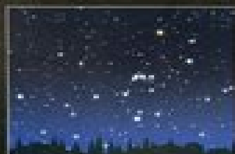
APRIL 15, 8 PM