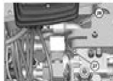
Diagram 8 g0007144