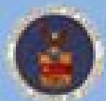
Department of Labor