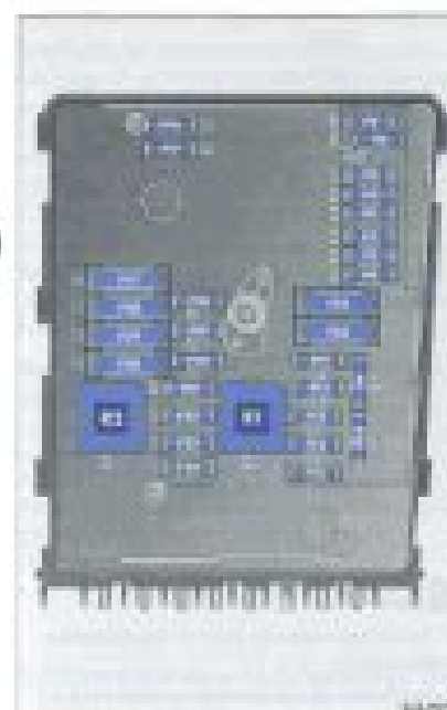
Fig. 41 Fusibles de la caja de fusibles del vano motor, Versión A (Low Box)