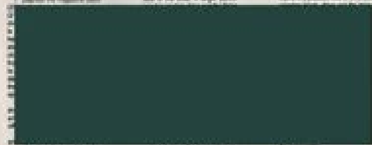
1. Slide down from the top of the slide